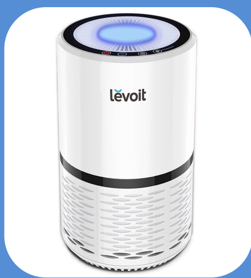
HEPA Air Purifier

A disinfectant sprayer will be used to clean our outdoor play space with a nontoxic EPA approved solution after each use.