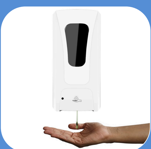
Touchless Hand Sanitizer Dispensers

Two commercial grade hand sanitizer dispensers have been installed. Located at gate entry for all adults for entering/leaving and in outdoor play space for teachers and supervised children.