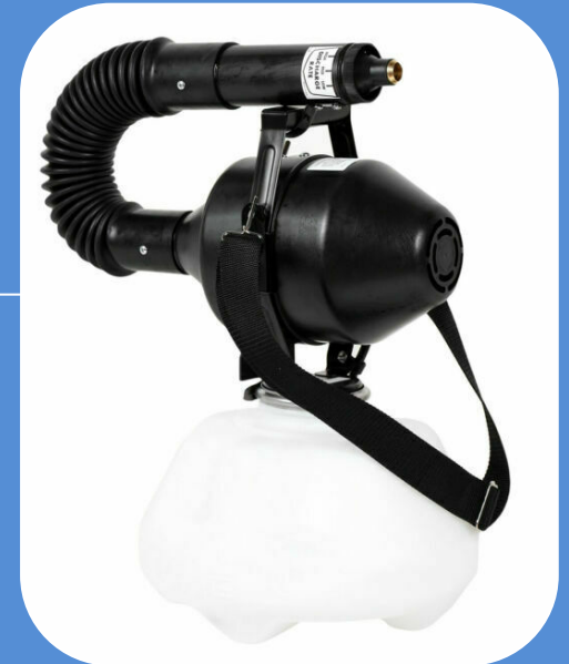
Professional Grade Disinfectant Sprayer

We will continue the use of our HEPA air purifiers in the classroom to ensure cleanest breathing air possible.