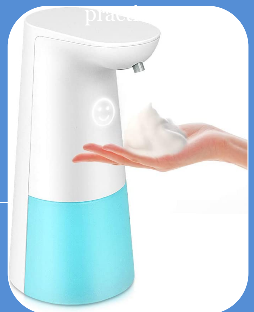
Touchless Soap Dispenser

All rugs have been removed and replaced with these high-quality foam mats that can be sanitized and wiped clean throughout the day.